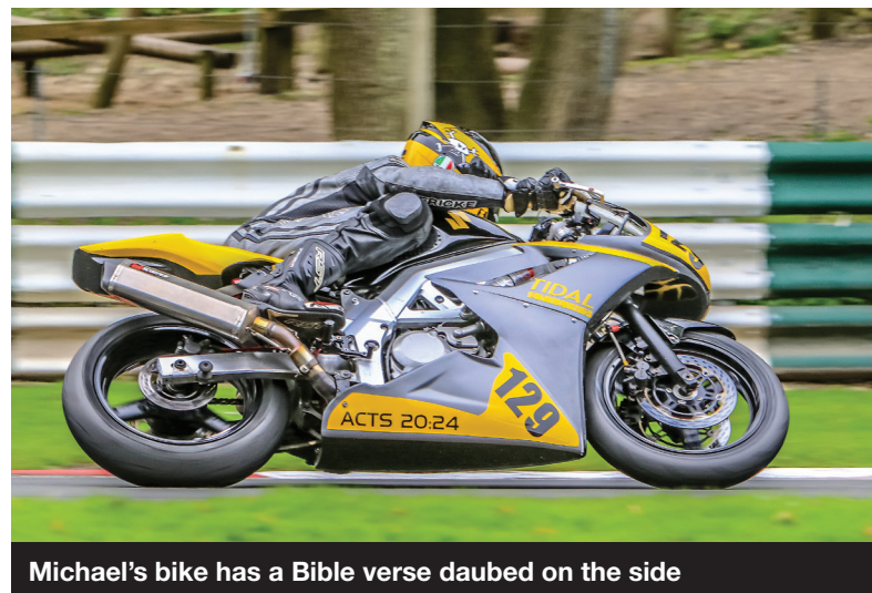
Michael's bike has a Bible verse daubed on the side

THERE'S something different about the motorbike as it roars down the racetrack and spectators glimpse the rider kicking out a gear to accelerate into the fast lane.